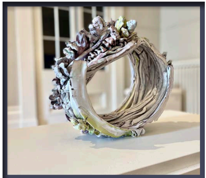
| Amber Zuber, Norfolk Studio Tour Exhibition Starr Gallery