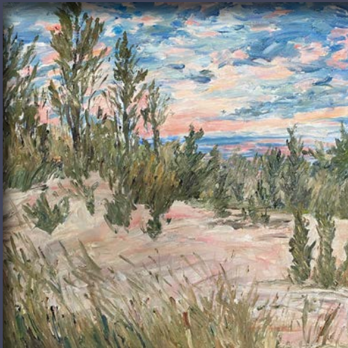
| Bruce Steinhoff painting