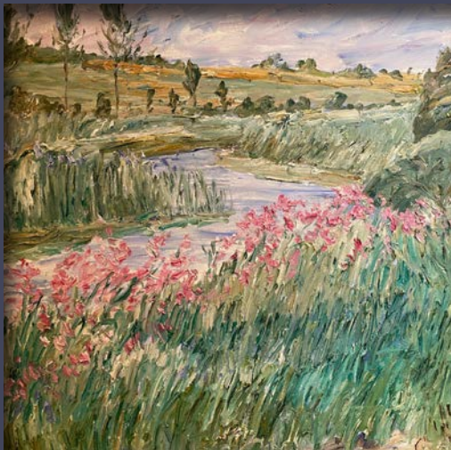
| Bruce Steinhoff painting